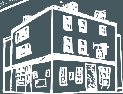
THE LAZY PUG