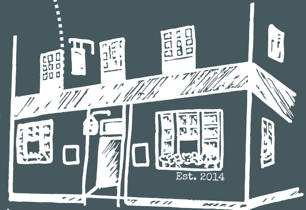
THE ROYAL PUG